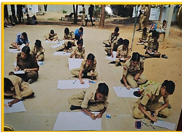
Drawing competition for NCC cadets at CATC Camp