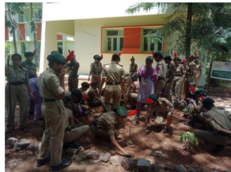
Saplings Planted In Hostel And College Campus