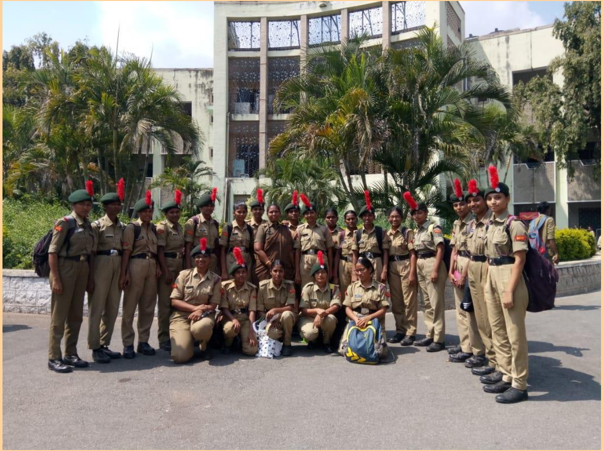
C- Exam Theory was conducted at S,V. Arts College, Tirupati